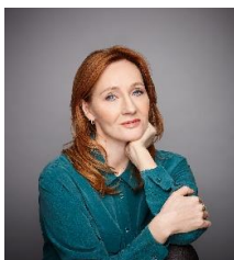
J K Rowling – 1965-Present Day

Analysing, Arguing, Classifying, Comparing and contrasting, Defining, Describing, Evaluating, Explaining, Problem solving, Tracking cause and effect