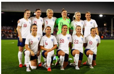
Women's England Football team 2019

Listening actively, Reading, Speaking, Turn taking, Using technology, Writing, Social Communication