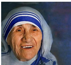
Mother Teresa – 1910-1997

Allocating resources, Brainstorming, Decision-making. Delegating, Evaluating, Goal setting, Leading Managing time, Resolving conflicts, Team building