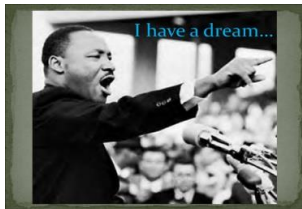
Martin Luther King – 1929-1968